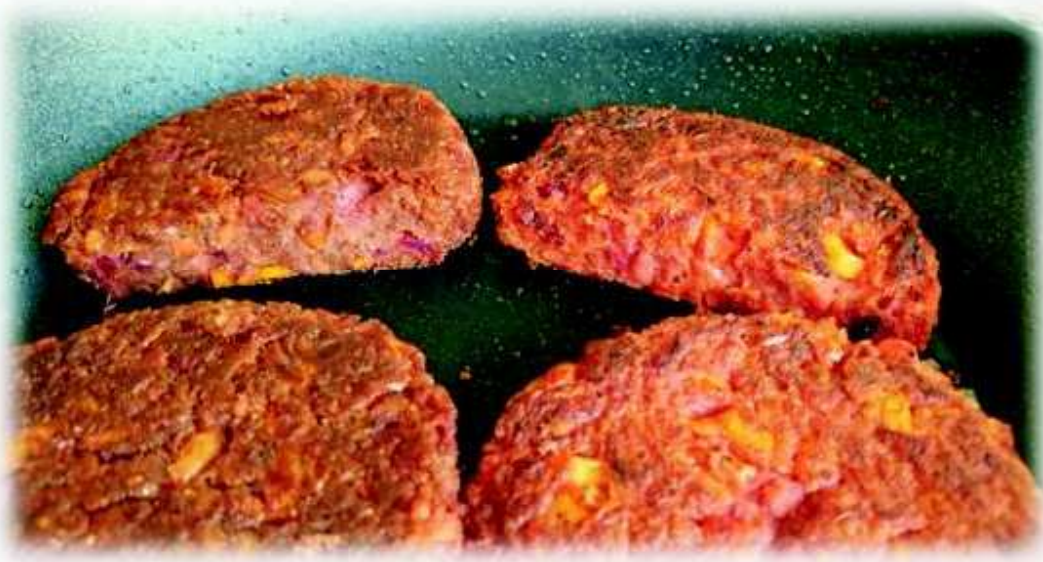
Burger with added fibre/protein on the left, control to the right

We took it one step further with another study which confirmed the results above. Carrots, red beets, corn, white beans, yellow peas and onions were mixed briefly in a cutter and founded base for 100-gram burgers together with a small addition of spices and